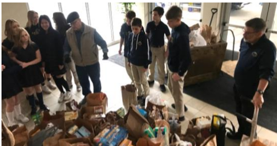
Students help load donated grocery items for our local food pantries.

THANK YOU FOR BEING A BLESSING! The St. John family has shown such kindness through compassionate service this year, many with simple items and acts of service that have made a real difference in Jesus' name. What a true blessing you all are as we share the love of Jesus through compassionate witness and service. The Mission Advisory Team has been able to accomplish much and to add 4 new mission partner's for the upcoming year because of your faithfulness. As we continue to support our mission partners and our community, we thank you for continuing to be ONE in Jesus, Reaching Many!