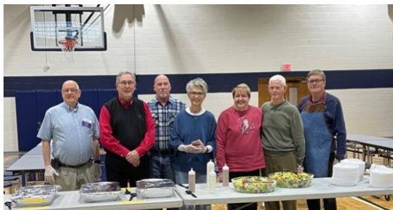
Volunteers serve dinner between the midweek Advent services.