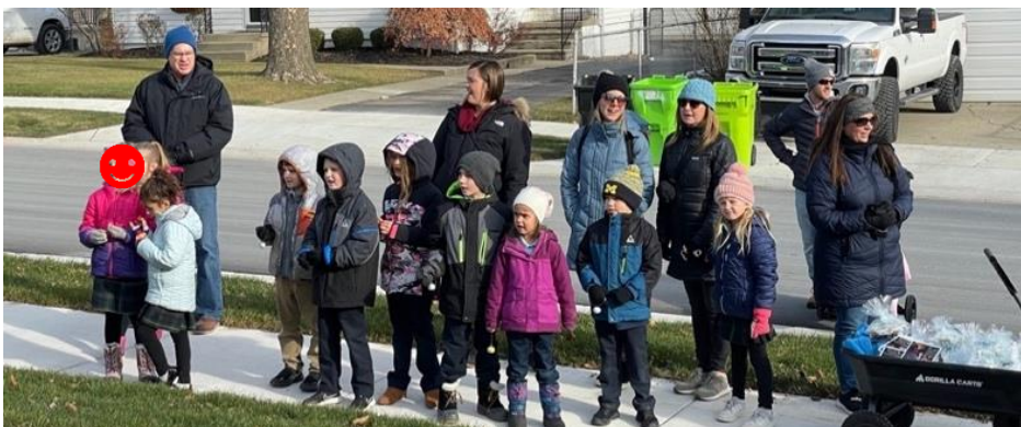
First grade students visited our local neighbors to sing and deliver cookies for Christmas.